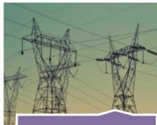
$100bn to modernize the electricity grid