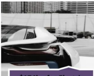
$174bn for Electric Vehicles

$621BN FOR TRANSPORT AND INFRASTRUCTURE INCLUDING: