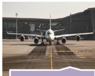
$25bn for Airports