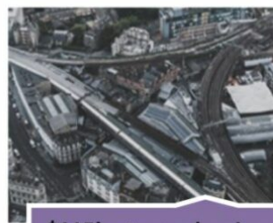
$115bn to modernise bridges and roads