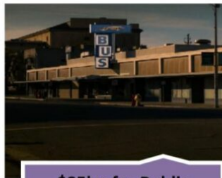
$85bn for Public Transit