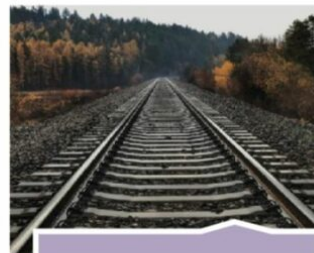
$80bn for Railways