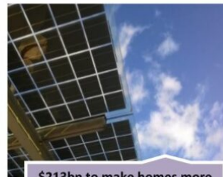
$213bn to make homes more affordable, sustainable and energy-efficient