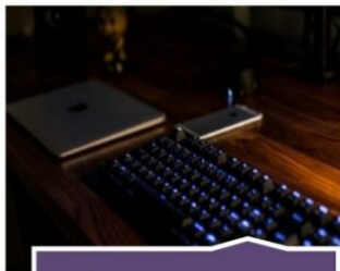
$100bn for high-speed broadband