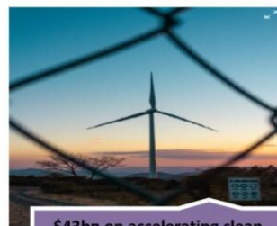
$43bn on accelerating clean energy and plugging orphan oil and gas wells