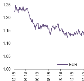
EUR vs. USD